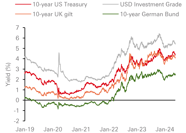
Chart 1: The prospect of rate cuts has caused yields to peak and drives more investors to lock them in

Past performance is not a reliable indicator for future performance.